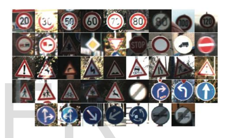
Fig 1. Sample images from GTSRB dataset

After cleaning and removing the redundant and repetitive frames the dataset is reduced to total 51,840 images of the 43 classes. All the images in the dataset have 32*32 size and the total dataset is divided into training data and testing data. Total 39,209 images are present as training data and 12,630 images as test data